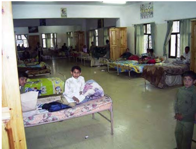
Dormitory at the orphanage Hajja

500 EUR of this donation will be transferred to 2006. In addition to further investments, VHI is planning a trip for the children to visit the Red Sea.