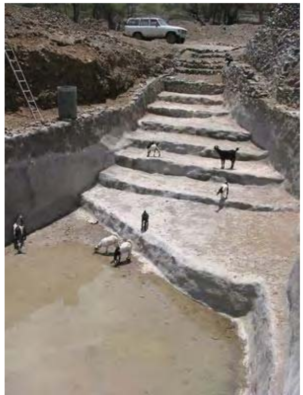
Cistern in Humlaan

Altogether, 2,000 sacks cement were originally purchased from a small dealer. Because of the rapid 1.7 fold increase in the price of cement, the dealer did not honor the contract but refused to deliver the remaining 485 sacks of cement. The case was taken to court where a decision is currently in process. Meanwhile, the monies previously allocated for transportation were used to purchase an additional 250 sacks of cement which were then delivered to the six sub-districts (total amount of cement: 1,765 sack).