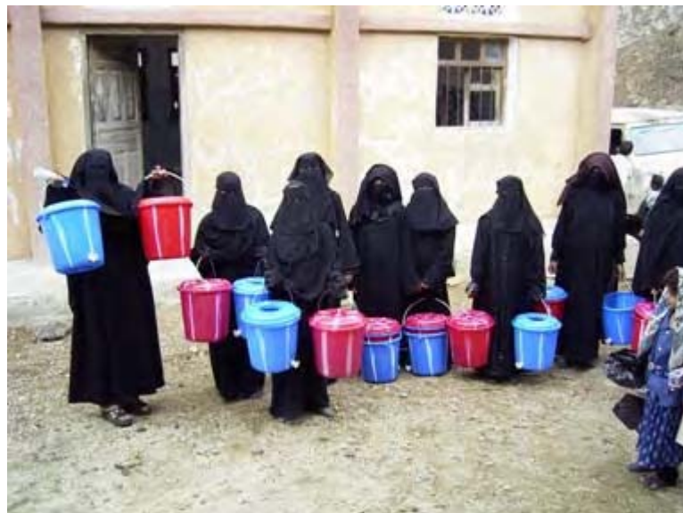
Filter distribution in Hirba (picture from previous project)

During 2004 and 2005, VHI financed 200 of these water filters. In addition to the remaining means from 2004, this project was supported in 2005 with 476.76 EUR. A large portion of these funds was collected by a church in Friedrichshafen.