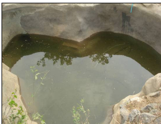
A picture can speak a thousand words – our local friends say thank you for the rehabilitation of this cistern (Al-Makfal, Project 1.2).

Therefore, we wish to express our gratitude for your interest and your partnership in our combined efforts to bring hope into the life of disadvantaged people: a hope that can be seen and felt. Thank you very much. Your support makes all the difference!