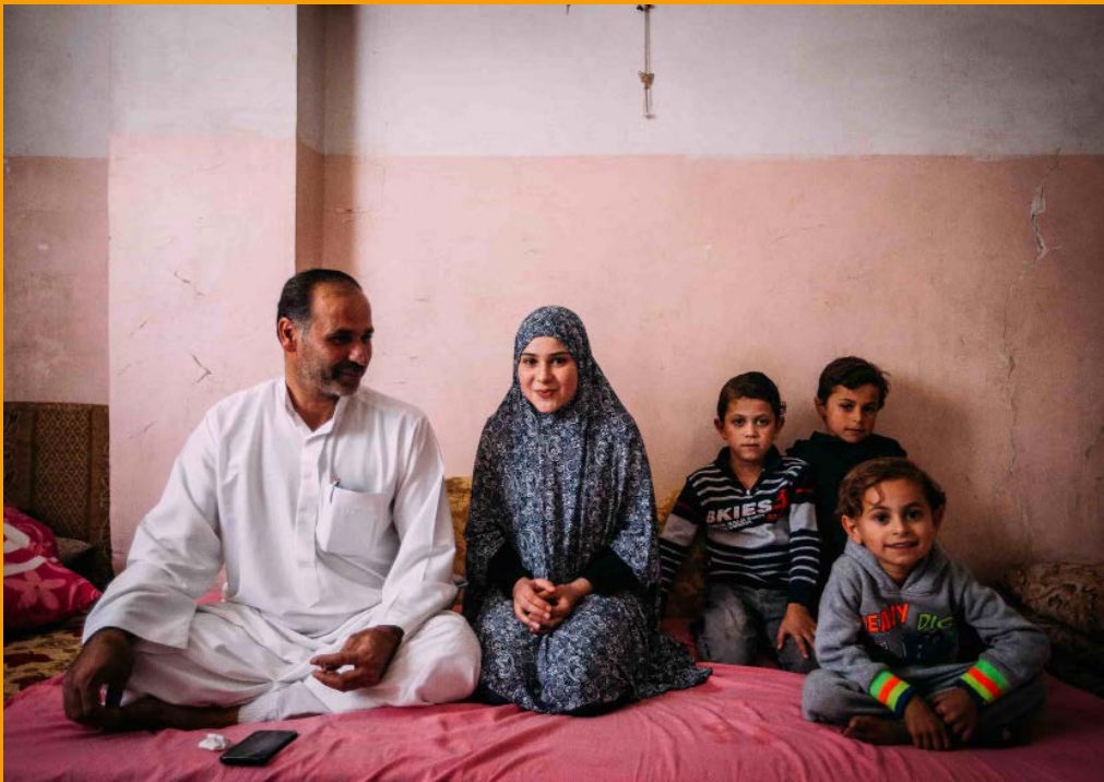
Photo: Refugee family from Syria